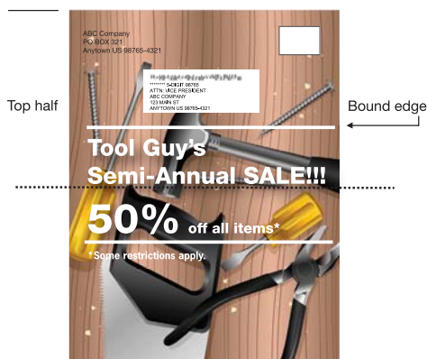
Catalog addressed on back cover. “Top” is the upper edge when the spine is on the right.

You can place the delivery address on the front or the back of the mailpiece, but it must be on the same side as the postage. The address may be parallel or perpendicular to the top edge, but not upside-down as read in relation to the top edge. A perpendicular address can face to the left or the right.